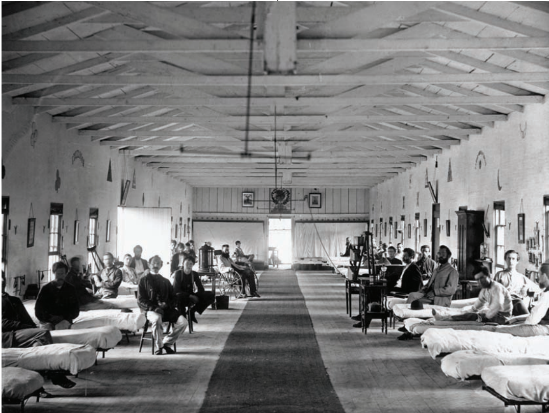
Armory Square Hospital, Washington, D.C., 1865. American neurologist Silas Weir Mitchell coined the term “phantom limb” to describe the sensations that Civil War soldiers felt in their lost limbs.

tions can occur in any excised body part, not just the arms and legs; people who have lost their breasts, teeth, genitals and even internal organs have had them. Women with hysterectomies, for example, have felt illusory menstrual pain and laborlike uterine contractions.